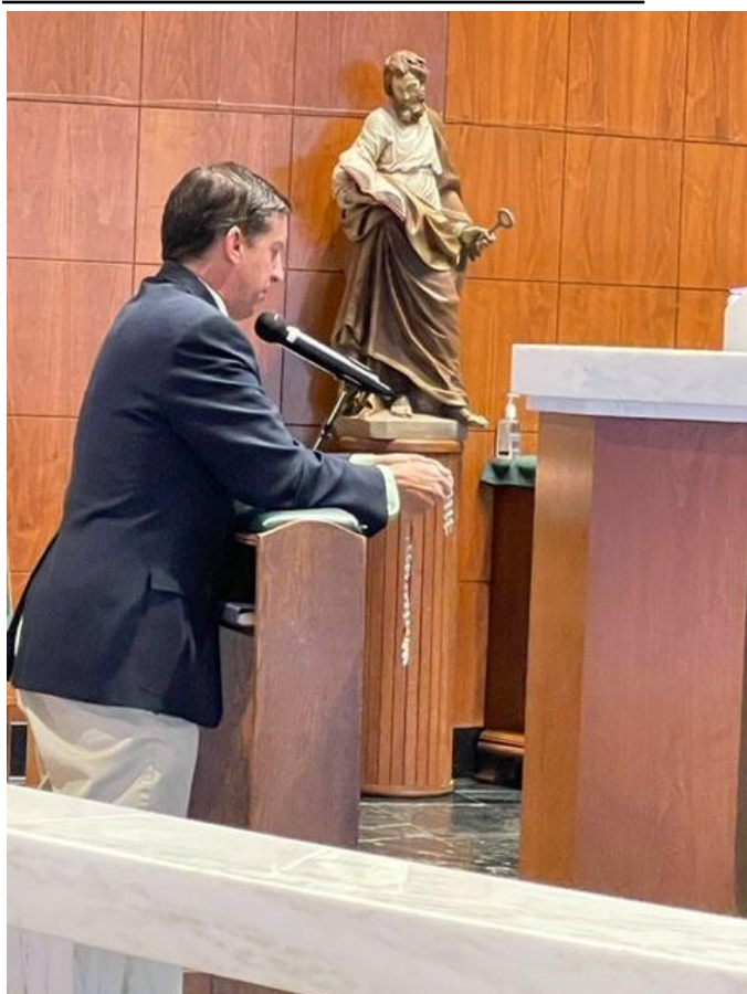
5th Sunday rosary, St.PiusX Oct.30th.