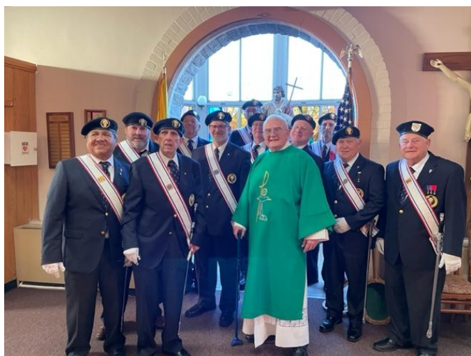
Deceased members mass Nov. 5th.