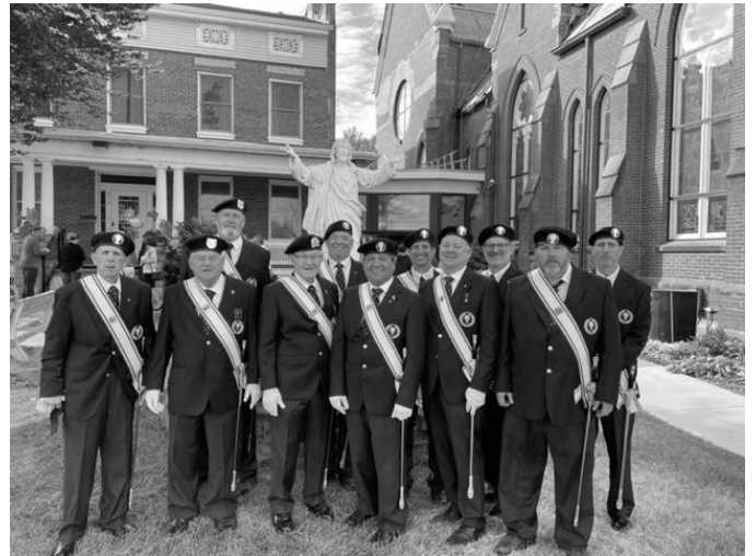
Blue Mass at Sacred Heart. Oct. 2nd.