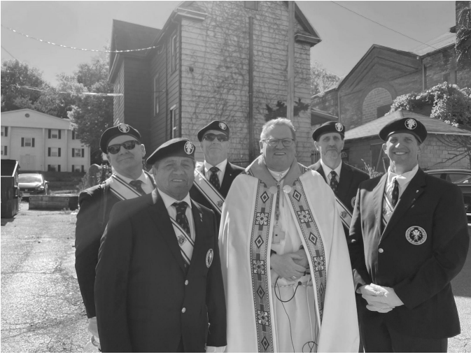
Emmaus Procession. Oct. 8th.