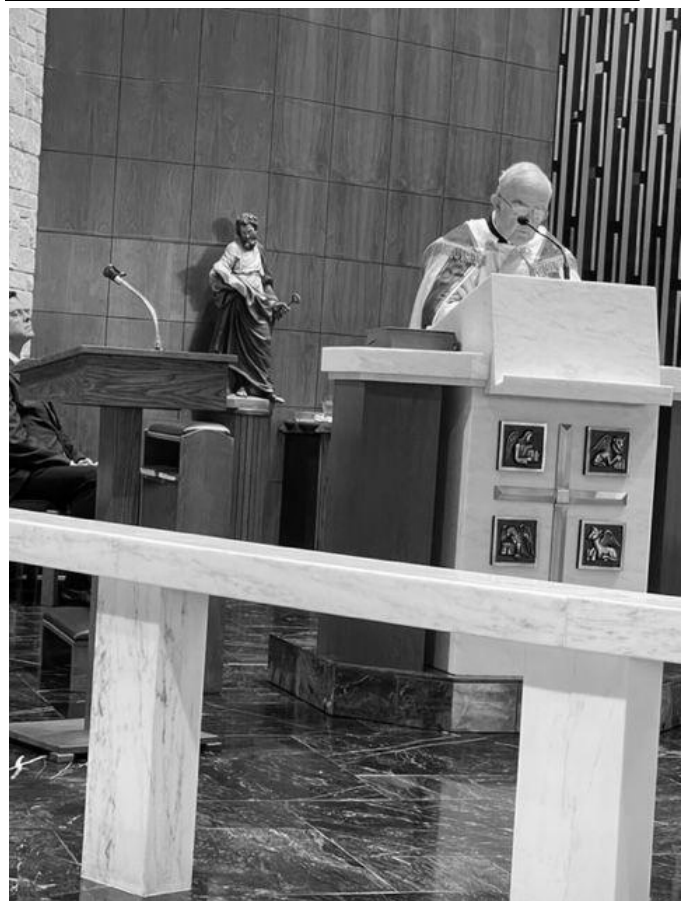
Holy hour at St Pius X. Oct.13th.