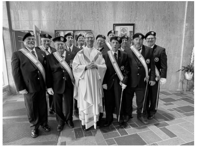
White Mass at St.Pius X. Oct.15th.