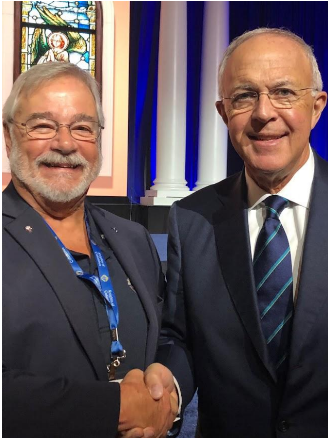
140th Supreme Convention