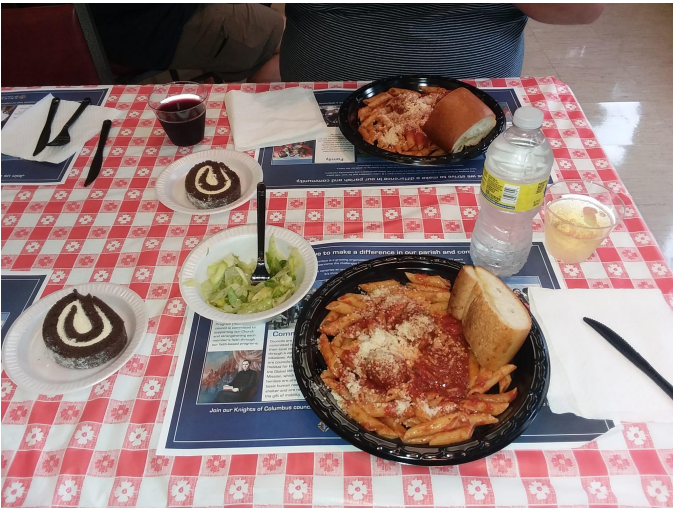
Authentic Italian Dinner