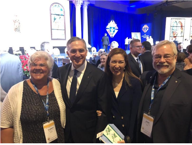
140th Supreme Convention