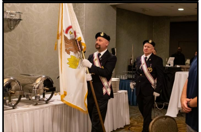
June 12th Civic Awards Dinner.