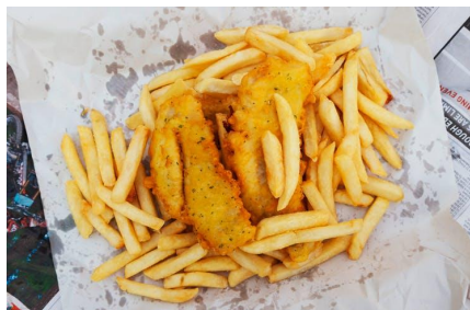
Option #1 Fried Fish & French Fries

Both Meal Options come w/ green casserole, mac & cheese, cole slaw, & dessert